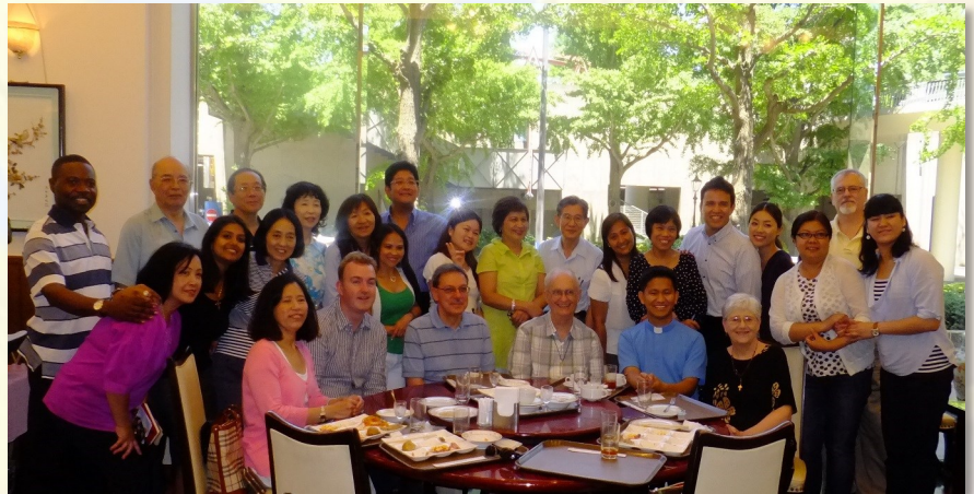
ICC luncheon at Hotel Miel Parque on June 15

And so with a heavy heart, we bid adieu to three prominent members of our community :