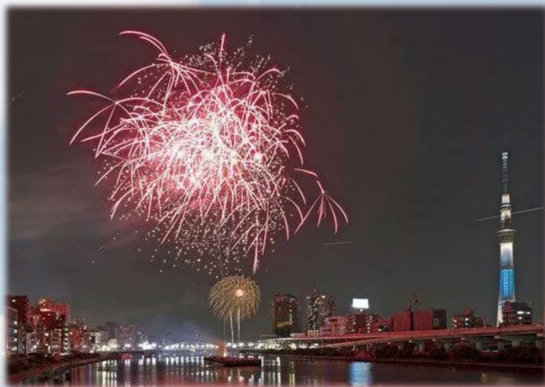
Fireworks over the Sumida River